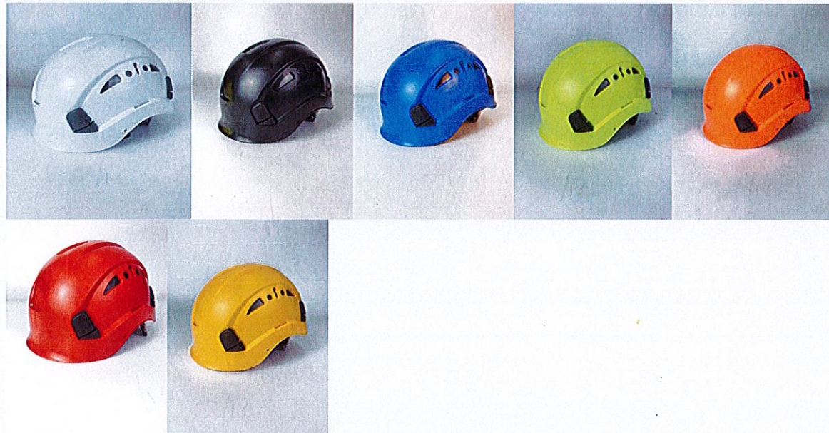
Helmets for mountaineers

The product identified above is in conformance with PPE Regulation (EU) 2016/425 and the Harmonised standard EN 12492:2012 .