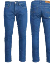
REBEL APPAREL WORK WEAR MEN'S JEANS – MID BLUE