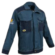
REBEL APPAREL TECH GEAR ACID FLAME JACKET