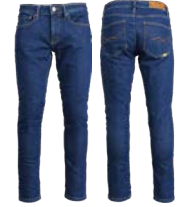
REBEL APPAREL WORK WEAR MEN'S JEANS – DARK BLUE

SIZE S-3XL WW-GSBRE ■ WW-GSNRE ■ WW-GSGRE ■