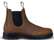
CODE RE219RB | SIZES 2-13 CLASSIC CHELSEA