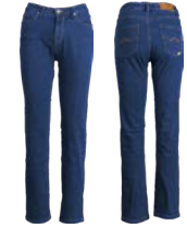
REBEL APPAREL WORK WEAR LADIES JEANS – DARK BLUE