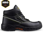
CODE RE811-HRO | SIZES 3-12 HRO CHUKKA BOOT