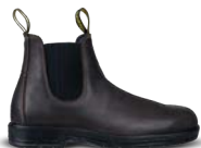
CODE RE219BR | SIZES 2-13 CLASSIC CHELSEA