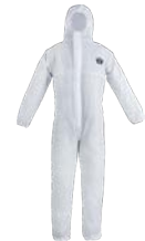
BODY PROTECTION PROGUARD 100 DISPOSABLE COVERALL