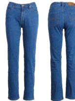
REBEL APPAREL WORK WEAR LADIES JEANS – MID BLUE