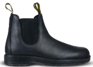
CODE RE219BK | SIZES 2-13 CLASSIC CHELSEA