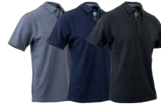
REBEL APPAREL WORK WEAR GOLF SHIRT

SIZE S-3XL WW-GSBRE ■ WW-GSNRE ■ WW-GSGRE ■