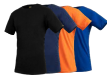
REBEL APPAREL WORK WEAR T-SHIRT

SIZE S-3XL WW-TSBRE ■ WW-TSNRE ■ WW-TSORE ■ WW-TSRBRE ■